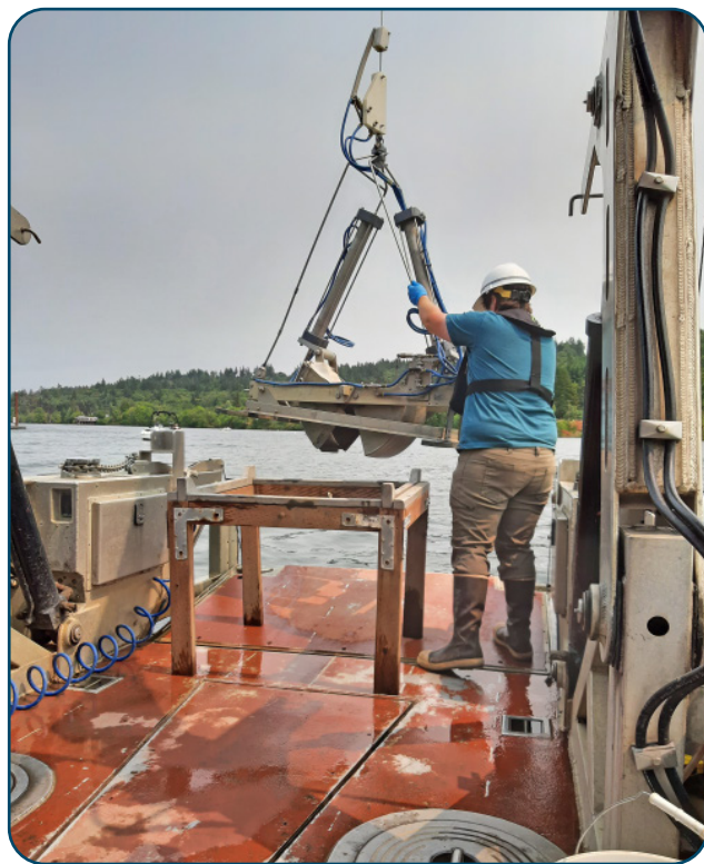
Figure 2. The power grab sampling device is guided to the edge of the research vessel to collect the next surface sediment sample for the 2021 Upriver Reach investigation.

EPA will continue to provide updates on any dioxin and furan information that could affect the Portland Harbor Superfund Site cleanup.