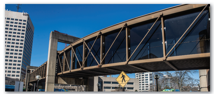
The bridge, pictured before construction, will receive roofing repairs.