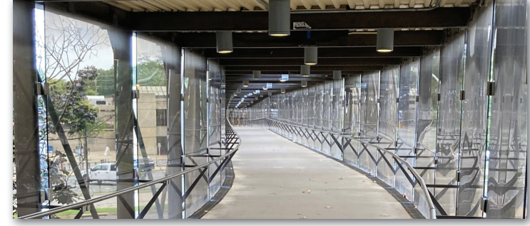
The bridge deck, pictured in 2020, will receive new non-skid coating