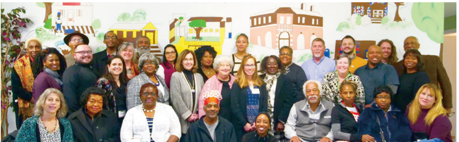
Maven’s Meeting, Eastover, South Carolina, January 2020.