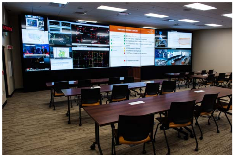
Figure 2. EIOC East Control Room

performance of the transactive algorithms and individual resources on each campus. It is being used to manage the conduct of each CETC experiment or demonstration and archive the operational data collected from them.