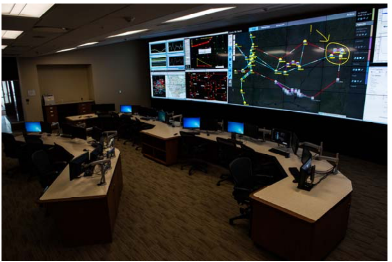
Figure 3. EIOC West Control Room