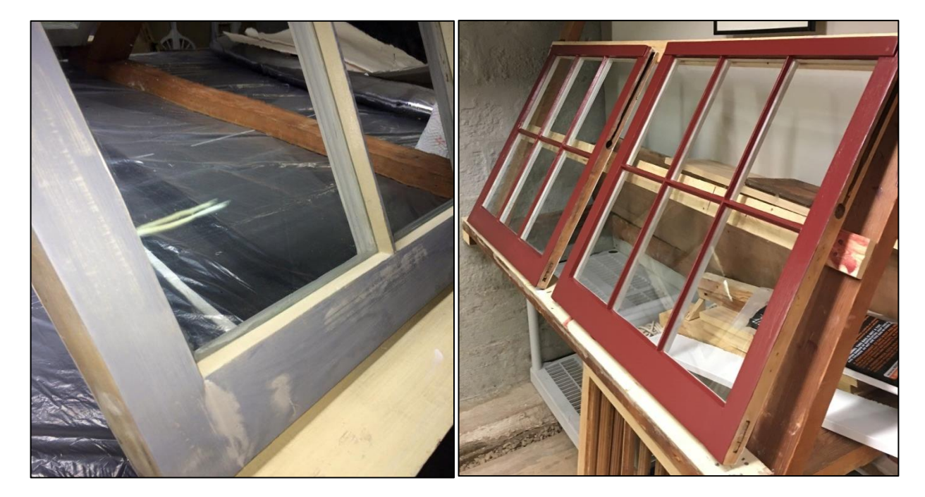
Glazing Putty: When you see signs of glazing putty failure, it is important to remove deteriorated sections and install new glazing putty and paint accordingly.