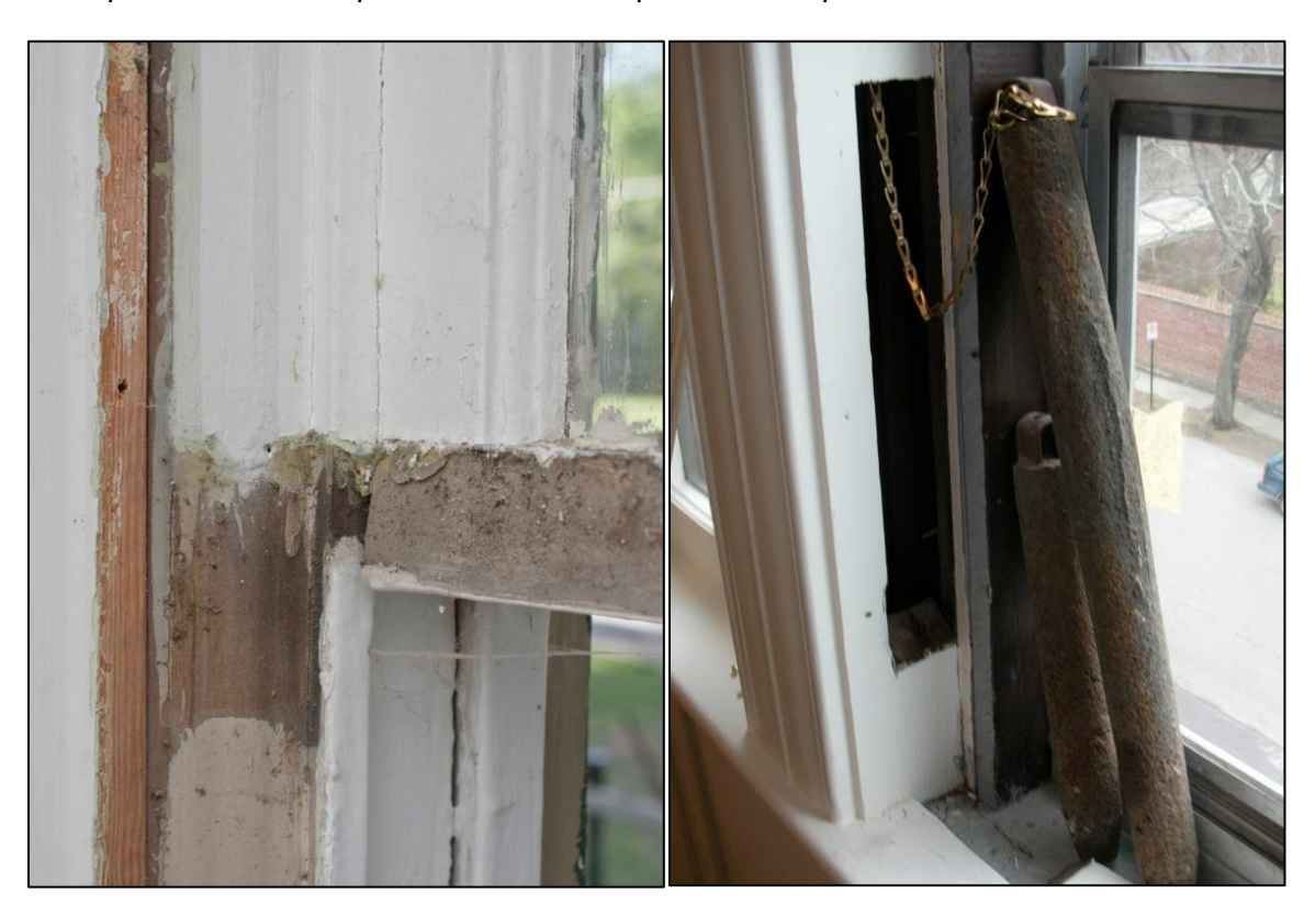
Operation: Cutting the paint seal, while replacing the sash cords/chains will increase the functionality of your windows. Before and after example below.

Examples of window repairs that do not require an LPC permit.