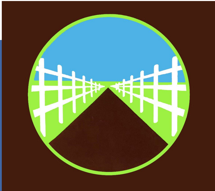
Rustic Roads logo used on brown street signs and RRAC correspondence