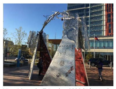
Meet Me at the Triangles, 2020 (Wheaton)

Trends to monitor over the six-year period to guide the priorities of AHCMC staff and the PATSC as strategic planning for the County's Cultural Plan begins: