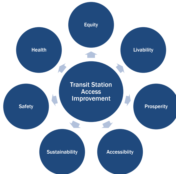
Figure 2: Summary of Impact Areas of HCT Station Area Access Improvements

Moving forward, optimizing HCTs could entail: