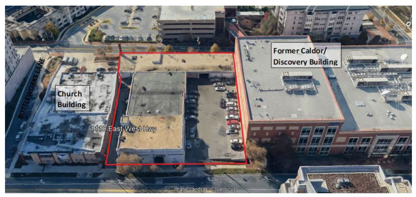
Figure 3: Bird's Eye View Showing Adjacent Properties