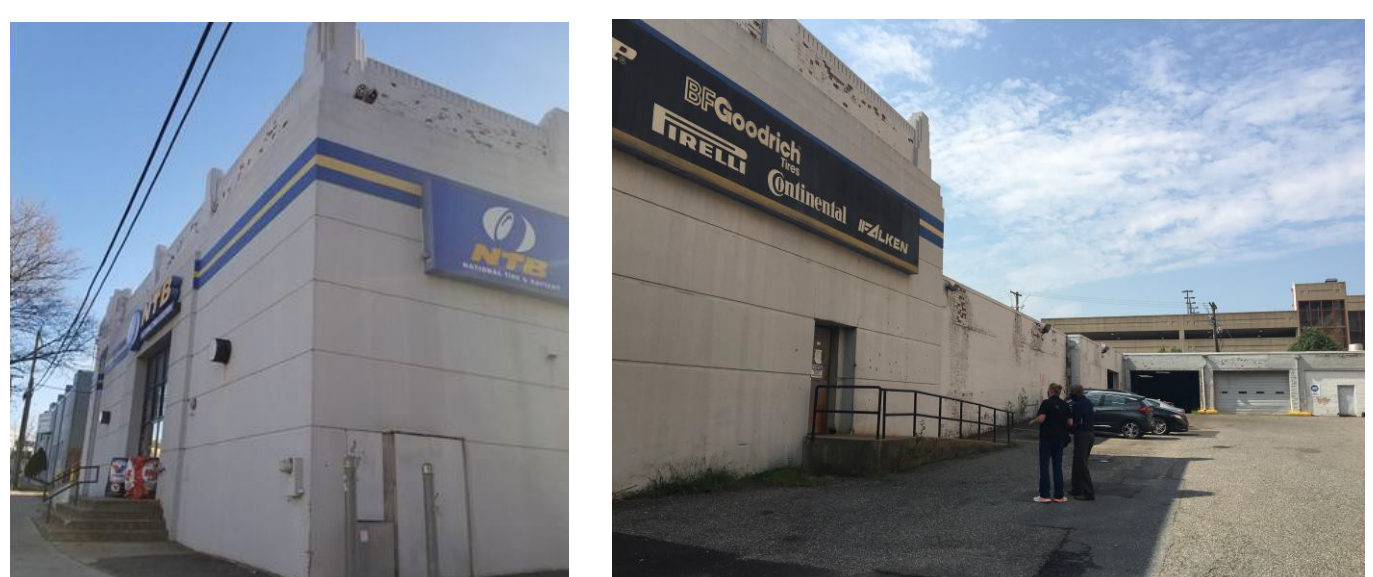
Figure 2: East-West Highway Frontage: NTB Entrance and Service Bay Access from Parking Lot