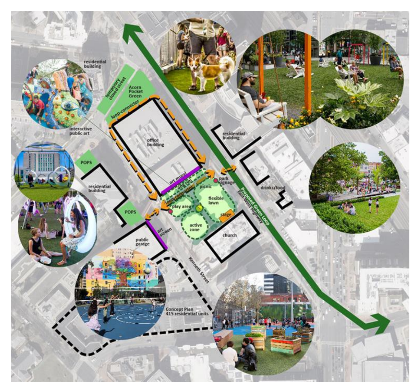
Figure 7: South Silver Spring Urban Recreational Park Concept