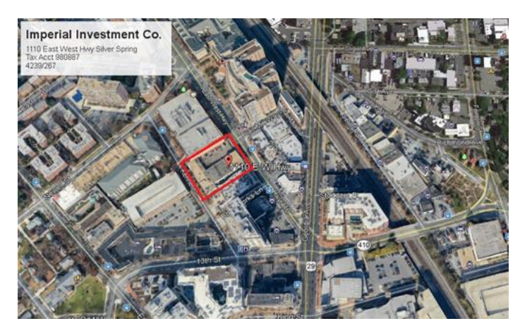
Figure 1: Vicinity Maps, Imperial Investment Property