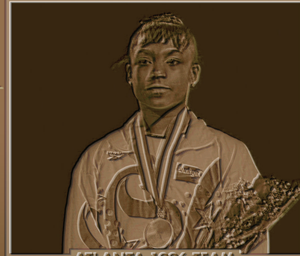
ATLANTA 1996 TEAM