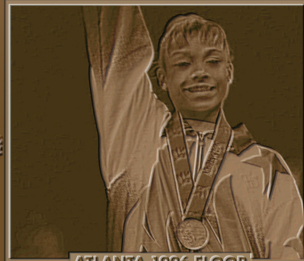
ATLANTA 1996 FLOOR