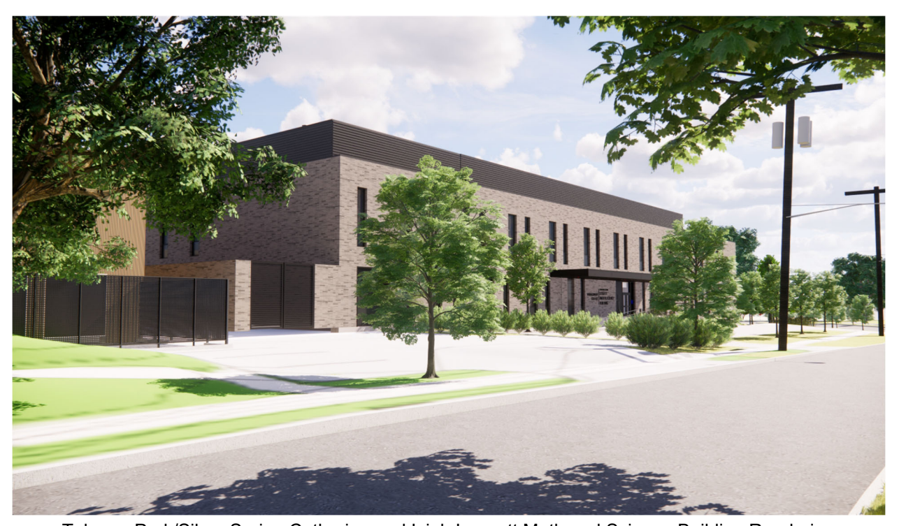
Takoma Park/Silver Spring Catherine and Isiah Leggett Math and Science Building Rendering

Each year on July 1, the College must submit to the Maryland Higher Education Commission copies of <u>CC-Table 1— Net Assignable Square Feet by Building</u>, <u>CC-Table 2— Total Existing Space Inventory— Net Assignable Square Feet</u> and <u>CC-Table 3— Community College Needs Computed in Net Assignable Square Feet</u>. The tables in this section are those submitted to the Maryland Higher Education Commission on July 1, 2021.