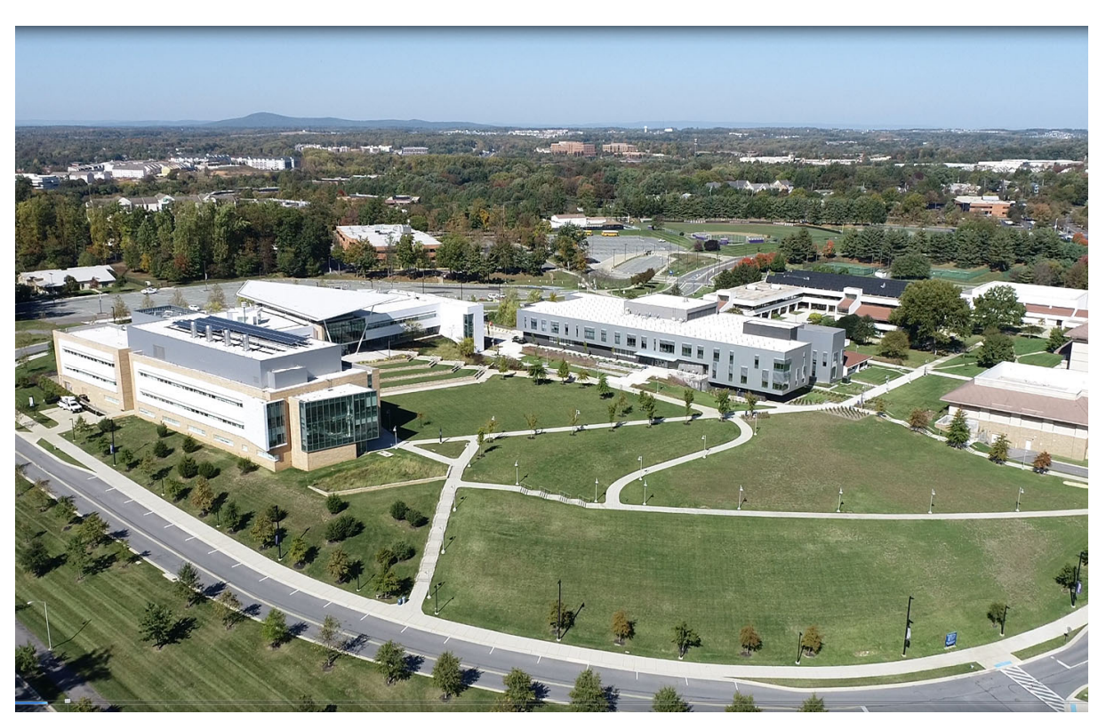
Germantown Campus Aerial Photo