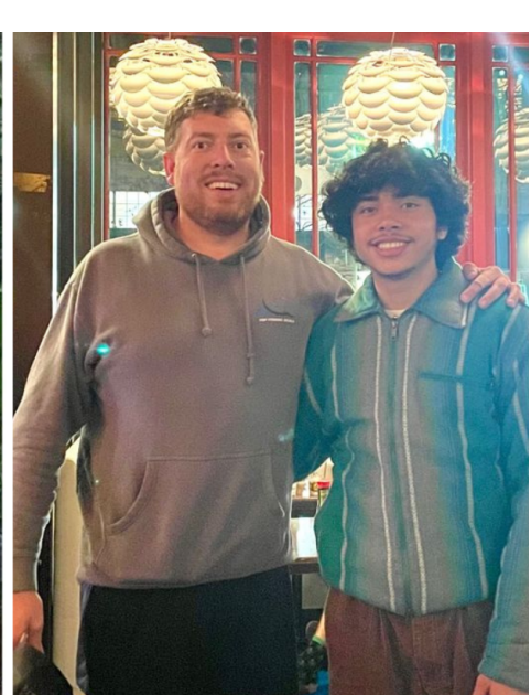
the US Botanic Garden; circa 2012.

lives. They have spent countless hours fishing, hiking mountains, visitingmuseums, and doing homework in the library. They have also supported one another through many of life's transitions. Throughout their time together, they have talked a lot about the value of working hard.