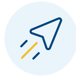
INNOVATION & TECHNOLOGY