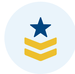
MILITARY & VETERANS AFFAIRS