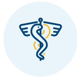
HEALTH CARE & LIFE SCIENCES