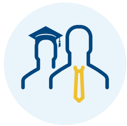
WORKFORCE & EDUCATION