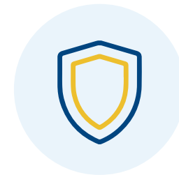
SAFETY, PREPAREDNESS & RESILIENCY