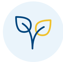
CORPORATE SUSTAINABILITY & ENVIRONMENT