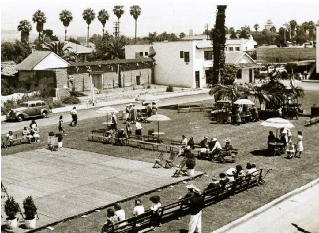
Exhibit 7, Plaza de la Guerra in the early to mid-1940s