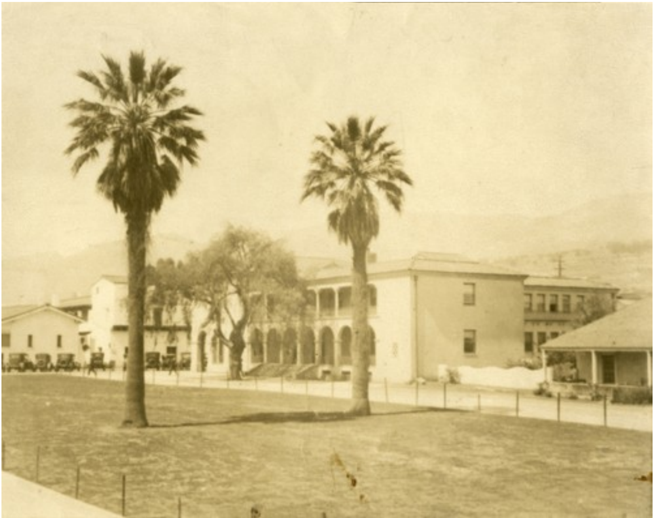
Exhibit 5, Plaza de la Guerra shortly after completion of City Hall (taken between 1924 and 1925)

Edson Smith Collection, Santa Barbara Public Library