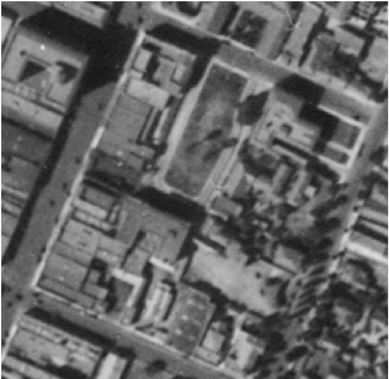
Exhibit 6, 1928 Aerial photograph of Plaza De La Guerra (Flight c-311c_b-11, Geospatial Collection, Special Collections, Library, University of California, Santa Barbara)