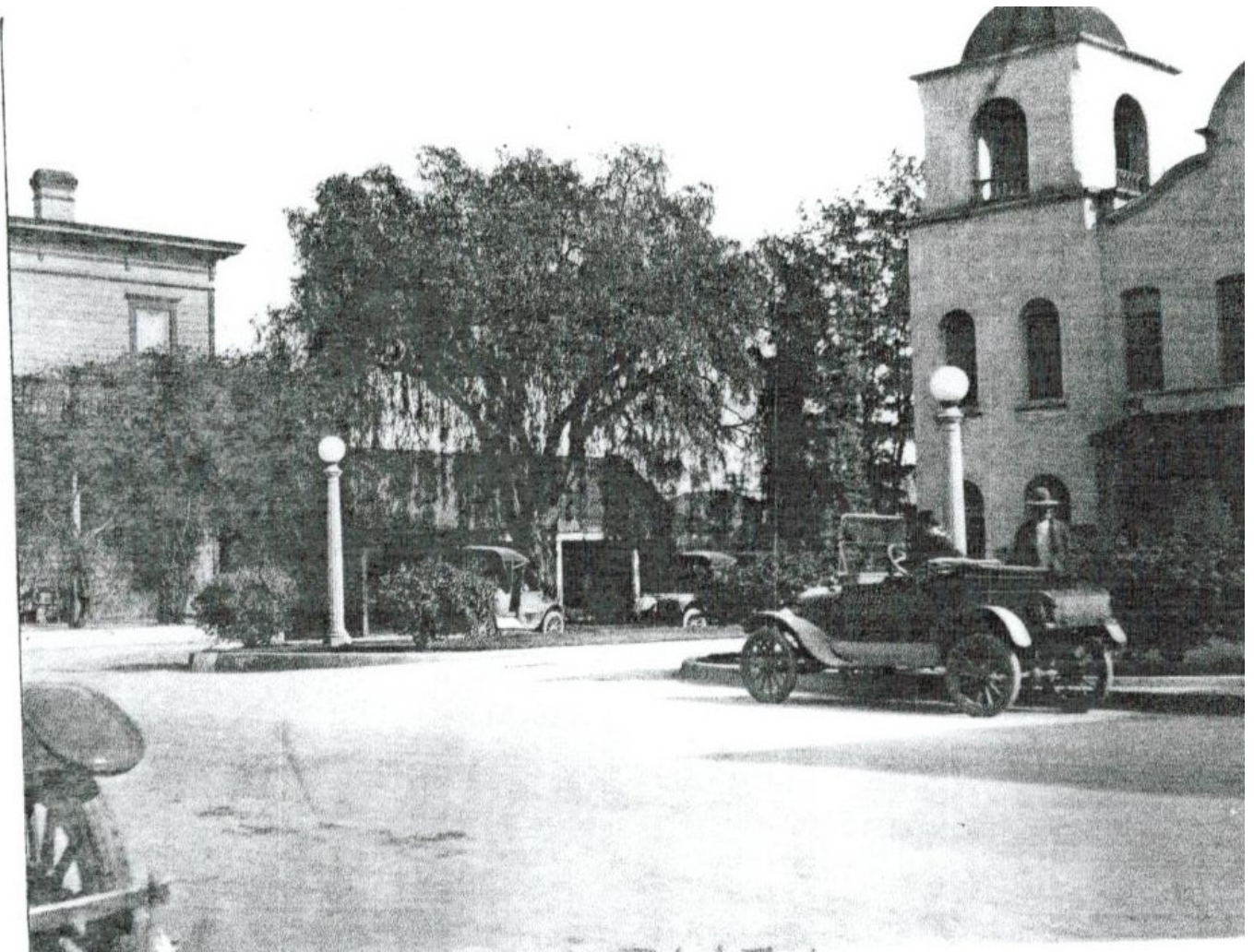
Exhibit 2, City Hall as remodeled in the early 20 th century with curbing and lamp posts in front of the City Hall