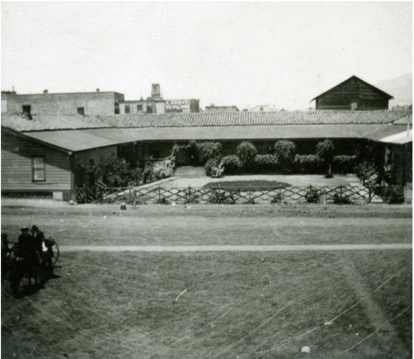
Exhibit 3, northwest end of Plaza de la Guerra from roof of the original City Hall looking towards the Casa de la Guerra