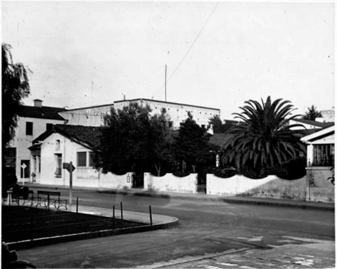
Exhibit 4, Photograph by Charles C. Pierce of the northeast corner of the Plaza http://hdl.huntington.org/cdm/ref/collection/p15150coll2/id/8013