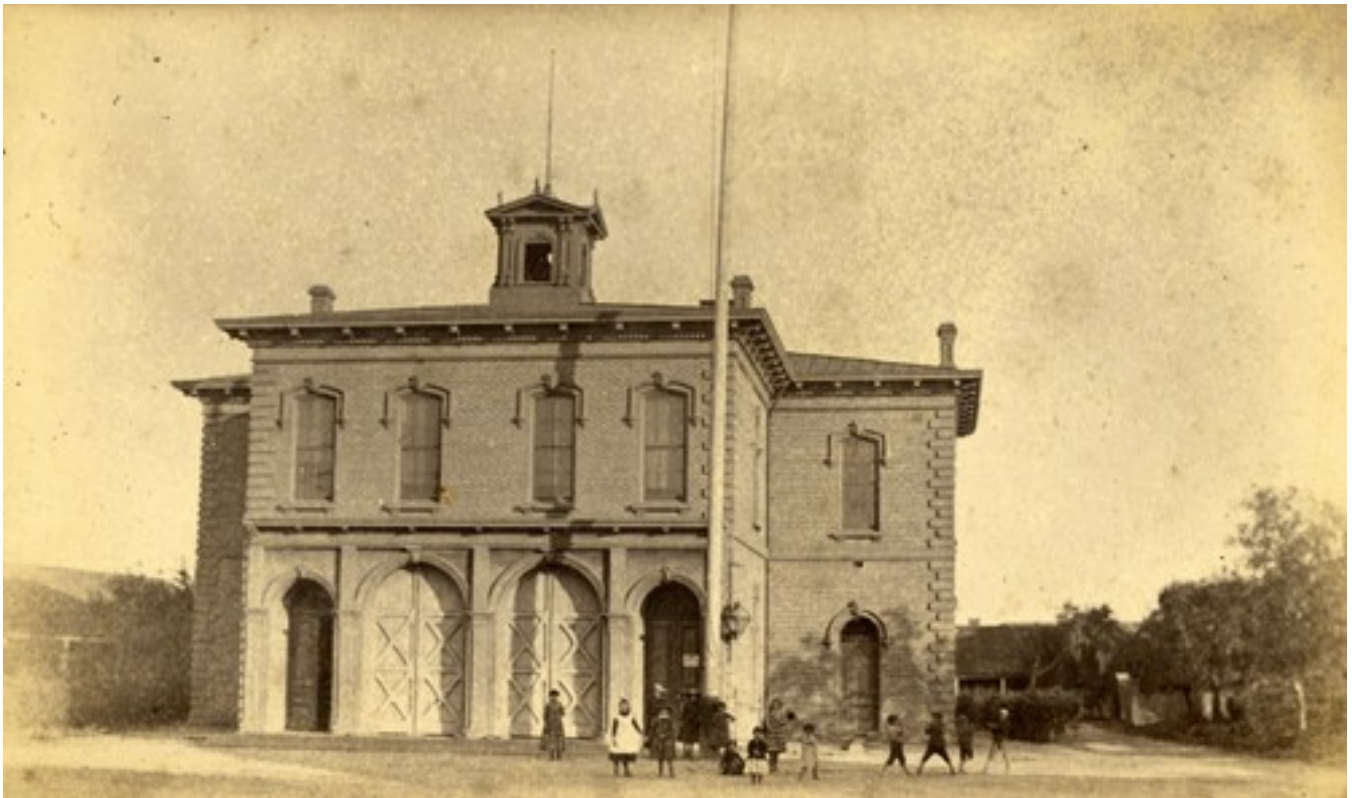
Exhibit 1, Original City Hall façade facing East De La Guerra Street in the 1870s or 1880s