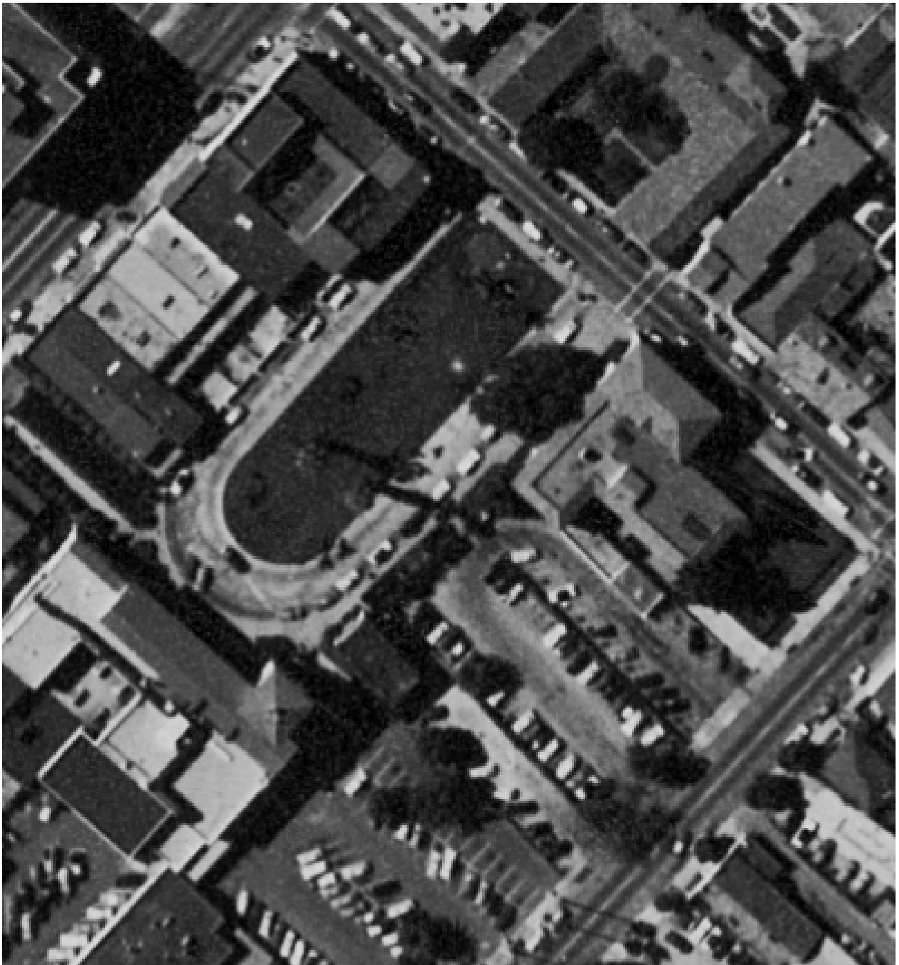
Exhibit 8, 1956 Aerial photograph of Plaza De La Guerra (Flight hg-an_1-47, Geospatial Collection, Special Collections, Library, University of California, Santa Barbara)