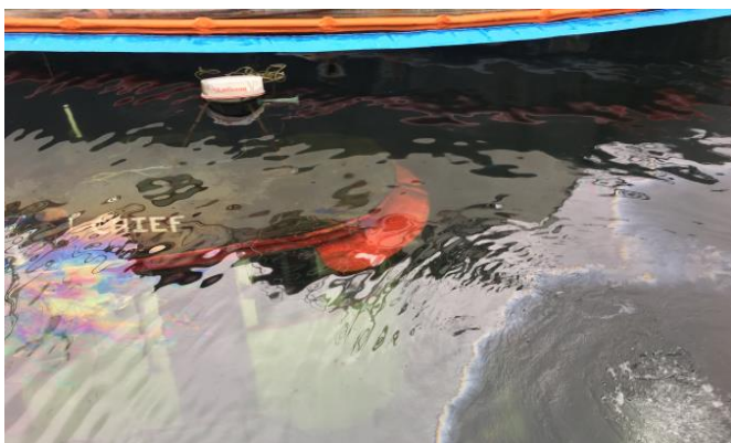
Figure 2. Containing an oil spill

The OSARS Volunteer program is designed to engage and prepare volunteers to assist with oil spills in the Puget Sound region. Each year, over 20 billion gallons of oil and other hazardous chemicals are transported in Puget sound. Trained volunteers can support spill response and assessment.