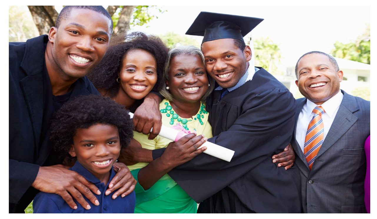
"It takes a village to raise a child." (African proverb)