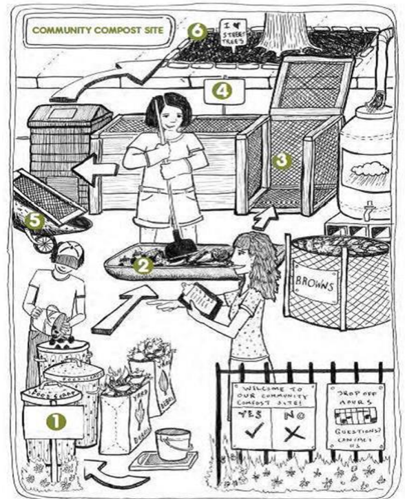
Image used with permission from the NYC Compost project Master Composter Course Manual. Chapter 4: Site Design & Management. Page 4-14.

Whether tumbler, bin, or pile–this is where the action happens! Signage is REALLY important, to keep everyone up-to-date on which tumbler chamber, bin, or pile to add to. Depending on your system management structure, you may want a separate log book here for tracking inputs, moisture, temperature, and any other management notes (when material was moved, any odor or vector concerns, etc.).