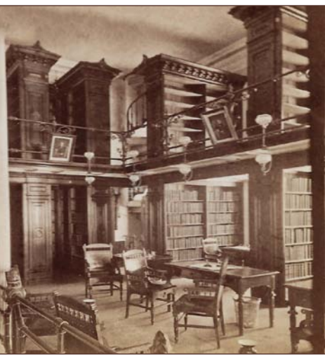
Above left: Tenney had an excellent view of the new State Library from her desk, located across from the main entrance. This c. 1878 image shows the bookcases, curio cabinets, and artwork she saw every day. Above right: Two cast-iron galleries wrapped around the library between the second, third, and fourth floors. Only Tenney and her staff could access those spaces via spiral staircases, since the library had closed stacks.