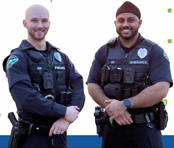
Bellingham Police Officers