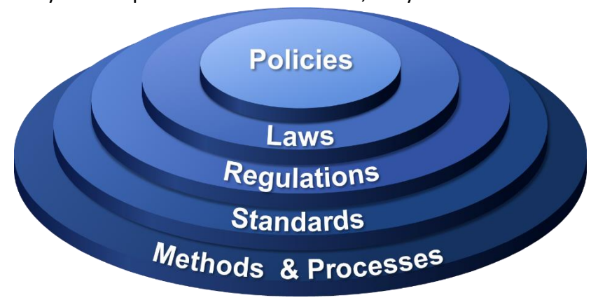
Figure 5: Policy to Process Pyramid

Our perspective is that AI policy goals are fulfilled only at the process level – the point where an AI system requirement is documented, AI system tests are defined, AI system performance is