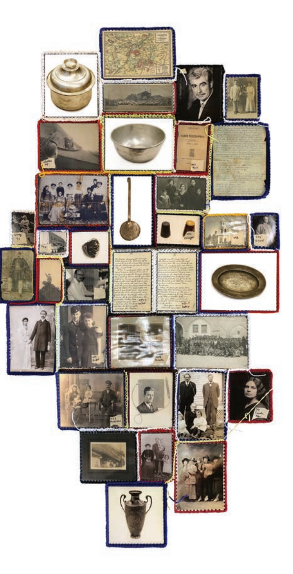
L.A. Carpet I, 2018 Laminated photo reproductions, wool